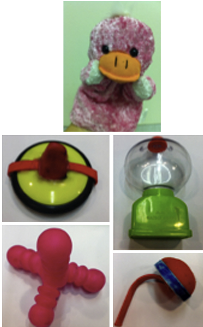
Fig. 1. Materials used in Experiment 1.

times (70%). Thus overall, object A was chosen 100% of the time over competitors, object B was chosen 70% of the time, and object C was only chosen 20% of the time (3 out of 15 times), consistent with a hierarchy of preferences where A is the most preferred, B is the second most preferred, and C is the least preferred (see Fig. 1 for a schematic representation of the procedure). Duckie's choices were designed to control for mere association effects; in order to succeed at inferring this hierarchy of preferences, children must infer that the relative proportion of Duckie's choices, not absolute number of choices, indicate his preferences, and there is no direct evidence that A > B > C ; rather, children must make inferences about the relative strength of preferences for A vs. B by comparing Duckie's choice rates of A over C and B over C.